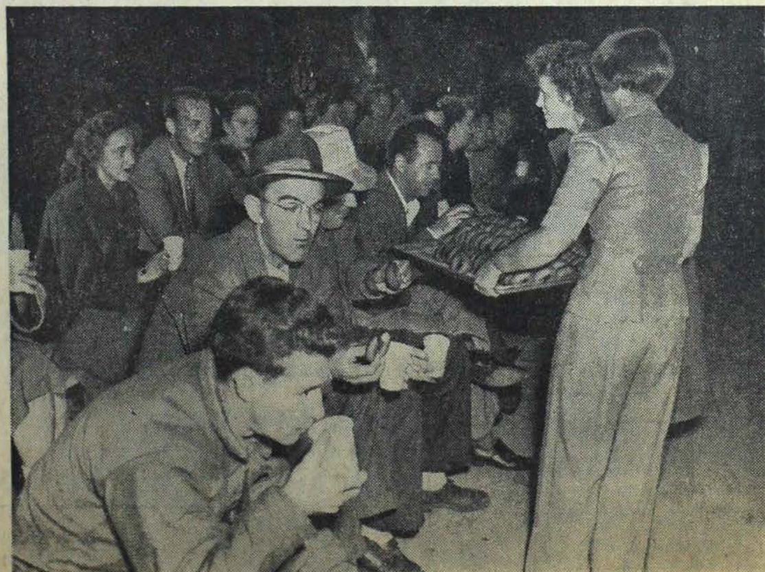
Members of the Westchester School P.T.A. serve coffee and doughnuts to parents waiting to enroll their children at